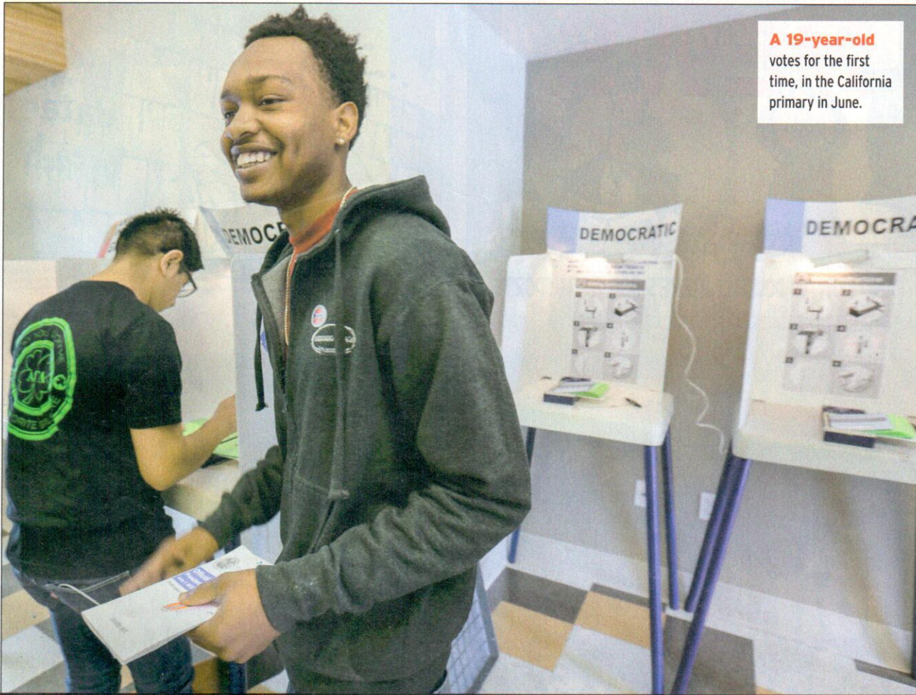
A 19-year-old votes for the first time, in the California primary in June.

NO Following the student protests against gun violence in school has come a renewed call to allow 16- and 17-year-olds to vote. But it would be a mistake to lower the voting age. Demonstrating is not the same as voting, which requires a higher level of civic responsibility and knowledge.